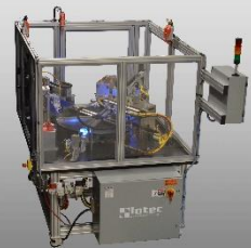
Automated Tube Flaring Machine